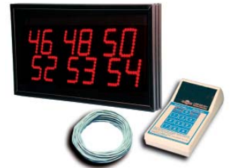
Multi-Number Wired System