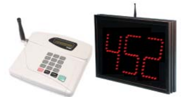
Single-Number Wireless System