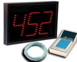
Single-Number Wired System