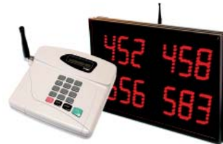
Multi-Number Wireless System

To grab the guests' attention, our Visual-Pagers® will slowly blink the numbers after a predetermined period of time (example: after 20 seconds, the numbers will blink slowly). Then you can have the numbers blink fast after they have appeared on the Visual-Pager® for a longer period of time.