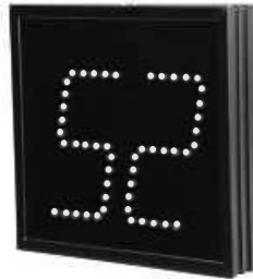
Model 4520 shown

Model 4520, 4530, 4540, and 4560 Wi-Fi Visual-Pager® Display