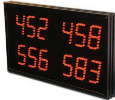
Microframe® Model 9430 Display

The Model 9430 Remote Display is designed to operate with the Microframe Model 9010 Keypad to provide a continually refreshed Remote Display of up to 32 different 3-digit numbers from 000 to 999. The signal and power is received from a single cable connected to the Model 9010 Keypad. Up to four displays may be connected directly to the Model 9010 Keypad.