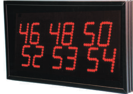
Microframe® Model 9620 Display

The Model 9620 Remote Display is designed to operate with the Microframe Model 9010 Keypad. The signal and power is received from a single cable connected to the Keypad. Up to four displays may be connected directly to the Keypad.